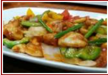
Gai pad med mamuang