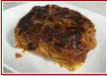
Lasagne alla bolognese