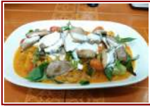
Gaeng ped pet yang