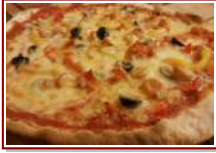
Pizza peperoni wurstel e olive