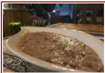
Risotto salame taleggio e vino rosso