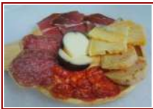
Affettati e formaggi misti

SUPPLÌ (FRIED RICE BALLS) AND CROQUETTES