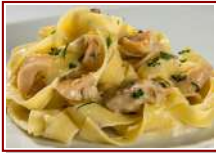
Ai funghi porcini