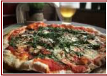
Pizza n'duja e rughetta