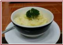
Purè di patate