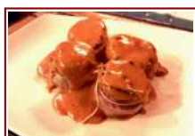
Filetto di maiale al pepe rosa