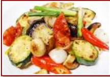
Verdure alla griglia