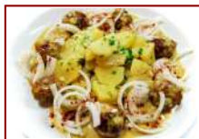
Polpette della Casa