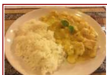
Bocconcini di pollo all'arancia e zenzero