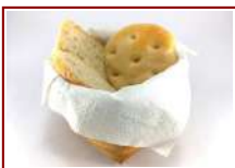
Cestino di pane