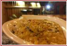
Risotto zafferano liquirizia e funghi

RISOTTO WITH HOMEMADE ITALIAN SAUSAGE, MUSHROOMS AND PARMESAN