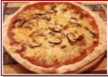
Pizza funghi salsiccia e gorgonzola