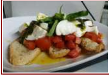
Bruschetta con pomodoro pesto e mozzarella