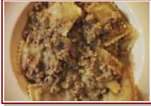
Ragù bianco di maiale