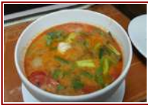
Tom yam goong