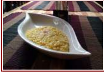
Risotto alla milanese

LASAGNE FILLED WITH BOLOGNESE SAUCE, MOZZARELLA AND PARMESAN