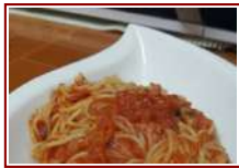
Pomodoro e basilico