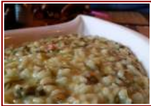
Risotto funghi e salsiccia