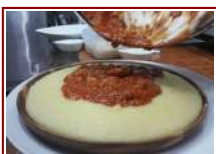
Polenta al sugo di salsiccia