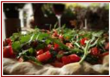
Pizza pomodoro e rughetta