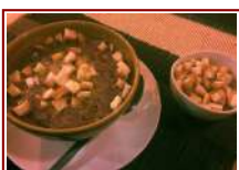
Zuppa di fagioli