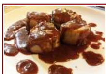
Filetto di maiale al vino rosso