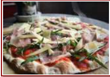
Pizza col prosciutto crudo rughetta e parmigiano