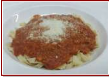
Ragù alla bolognese