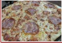
Pizza col salame