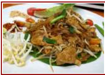
Pad thai gai / moo