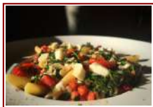
Pasta fredda alla rughetta