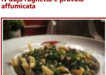
Salsiccia e cime di rapa