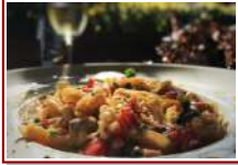
Salmore e pomodorini in salsa profumata

spaghetti, penne, tonnarelli, tonnarelli integrali, fettuccine, caserecce