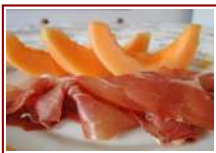
Prosciutto e melone