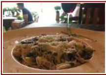
Funghi e rughetta