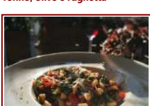
N'duja rughetta e provola affumicata