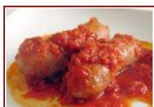
Salsiccia in umido