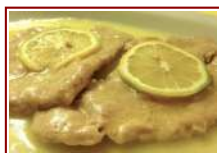
Scaloppine al limone