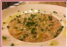
Risotto al salmone profumato alle erbe

● CREAMY SOUP WITH MUSHROOMS SERVED WITH BAKED BREAD