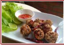
Laab moo thot