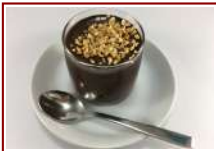
Mousse di cacao