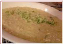
Risotto mantecato al formaggio di capra