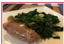
Salsiccia con cime di rapa