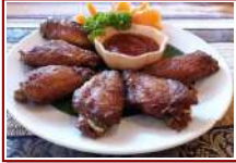
Bpeek glaang thot