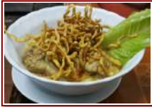
Khao soi gai