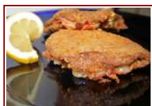
Petti di pollo alla valdostana