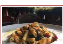
Tonno, olive e rughetta