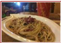
Crema di olive e prosciutto croccante