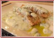
Salmon in sesamo con salsa alle erbe